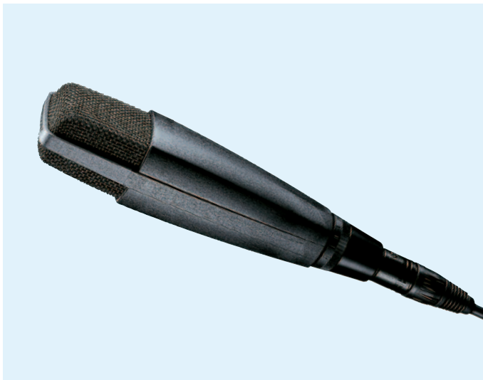
Cable pictured is an accessory not supplied with the microphone

The MD 421 II is one of the best known microphones in the world. Its excellent sound qualities enable it to cope with the most diverse recording conditions and broadcasting applications. The five position bass control enhances its 'all-round' qualities. Colour: black.