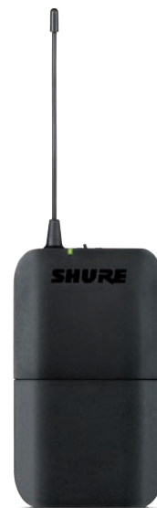
BLX1 Bodypack Transmitter