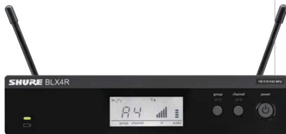
BLX4R Rack Mount Wireless Receiver