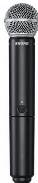
BLX2 Handheld Transmitter